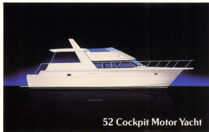
52 Cockpit Motor Yacht

The mid-ship salon is totally luxurious, with a custom U-shaped lounge, beautifully upholstered; a wet bar with icemaker; and a built-in entertainment center, with TV and stereo system. And there's custom-designed lighting throughout.